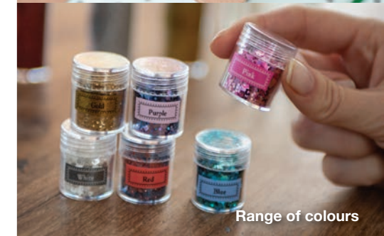
Range of colours