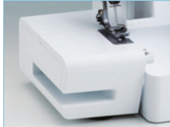
Free arm / Flat bed convertible sewing surface