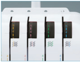
4 colour easy threading guide