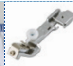
Taping (Elastic) Foot To attach tapes and elastic to stretch fabrics.