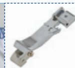
Gathering Foot For gathering and sewing in one operation.