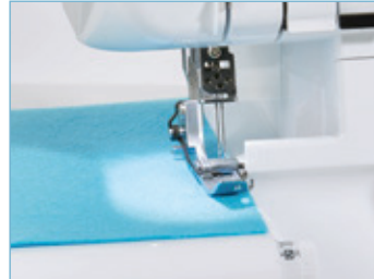
LED work light