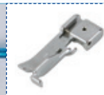
Piping Foot To attach piping between two layers of fabric.