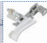
Pearls and Sequins Foot To attach pearls and Sequins to fabric.