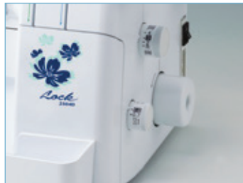
Easy access controls