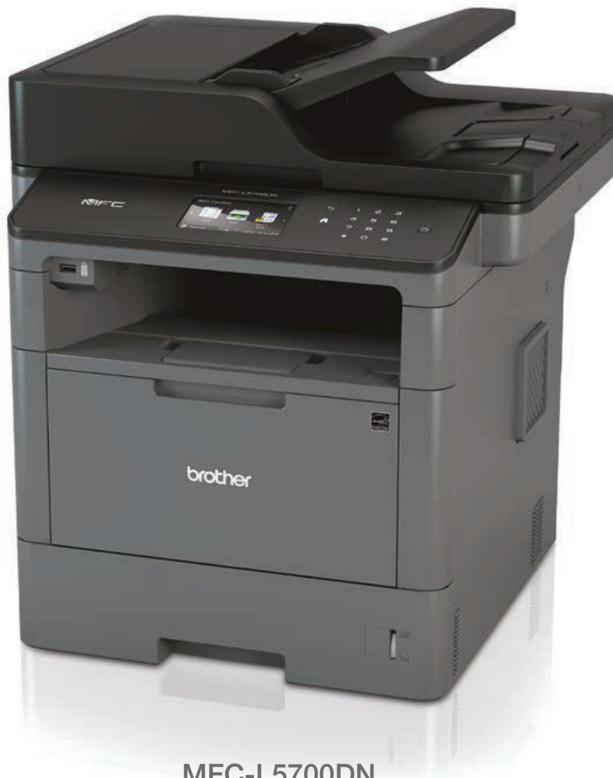
MFC-L5700DN Black & White Laser Multifunction Printer