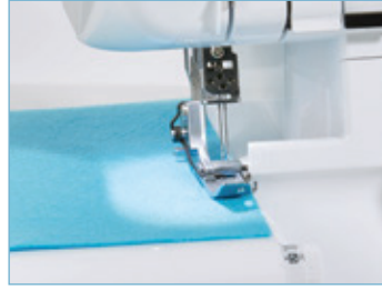
LED work light