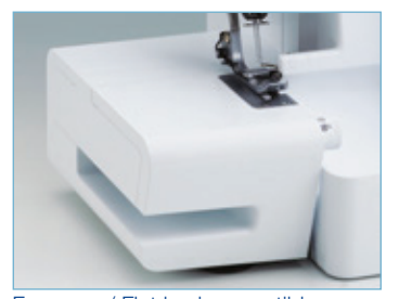
Free arm / Flat bed convertible sewing surface