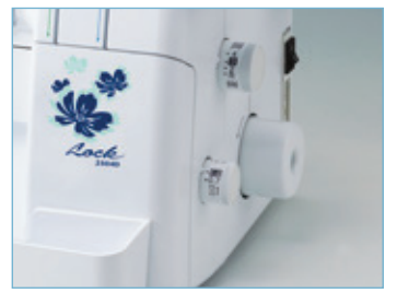
Easy access controls