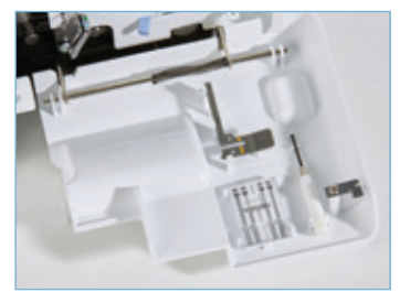
Built-in accessory storage